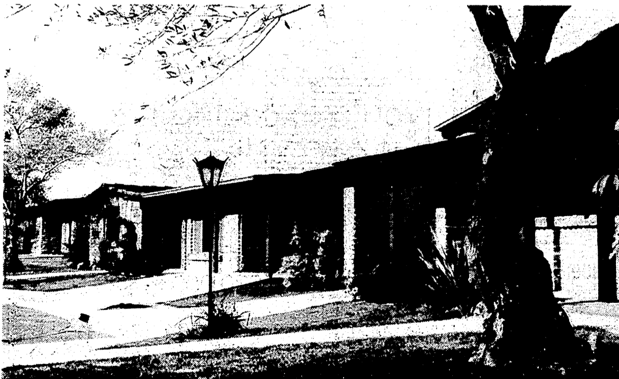
ADOBE VILLAGE: The earthen block also can give charm and warmth to the small house. Street scene is in Pala Mesa Village, a new community

important breakthrough in manufacture of adobe block. They found a way to waterproof the earthy mixture. Or more specifically, chemists of Standard Oil Co. during the late years of World War II discovered that by careful mixture of asphalt emulsion with the clay mud, they could "stabilize" the adobe brick; i.e. make it waterproof, and as permanent as concrete masonry. The result has been wider and growing acceptance of adobe for new construction. It has rustic appeal unmatched by other materials, an appearance that gives a dwelling the charm of natural strength and simplicity. Adobe homes are about as earthy and as natural as the soil from which the walls are made. One of the greatest tributes to modern adobe is that the (Continued on F-8, Col. 3)