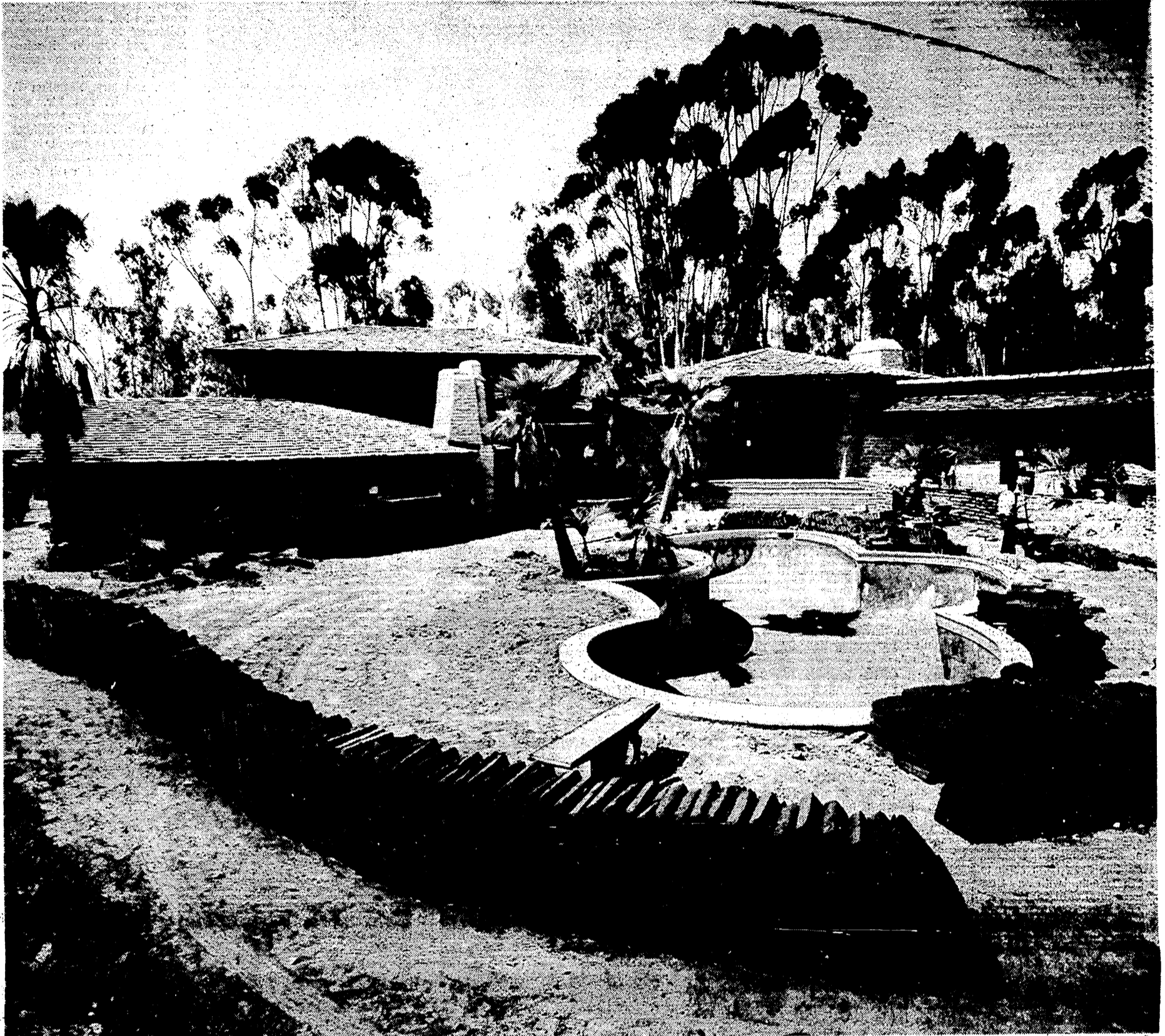
MADE FROM THE EARTH: Appreciation of the warm, rustic charm of adobe, a building block made from heavy clay soil, is leading to a growing revival of adobe construction of contemporary houses,