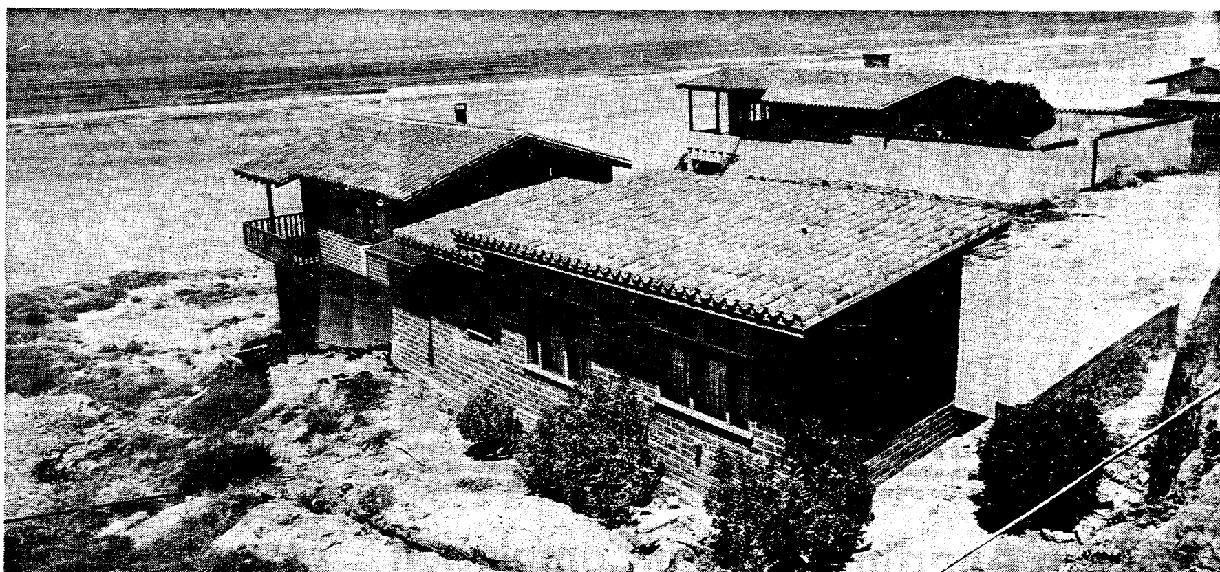
TYPICAL ARRAY of homes on the beach in Mexico are these small dwellings at La Misión, a growing American colony 36 miles south of the border between Tijuana and Ensenada. Most are second or vacation homes — a place to get