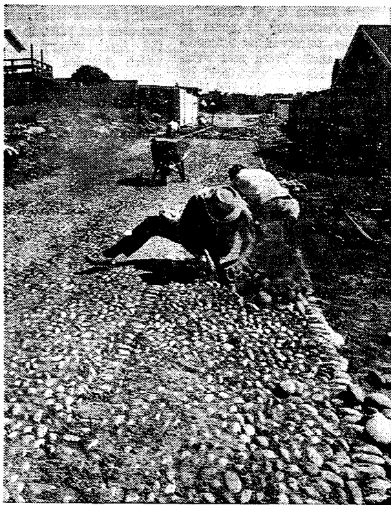
LA MISIÓN STREETS are being paved with cobblestones by workers who imbed rock in foundation of sand. It accents the primitive atmosphere.